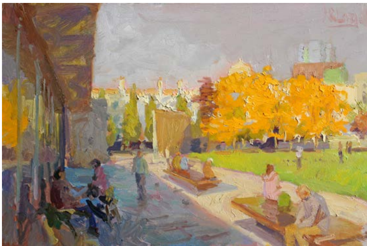
Norman Long Autumn Blaze, Piccadilly Gardens (12" x 18") Oils £795.00