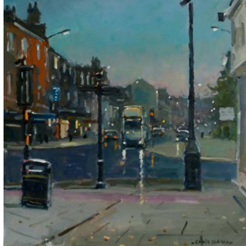
Chris Slater Northern Nocturnal (16" × 16") Oils £795.00