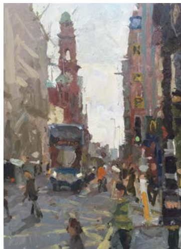
Adam Ralston Oxford Rd. (16" x 12") Oils £695.00