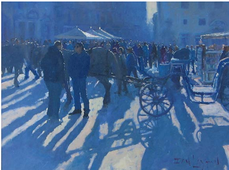
Ian Layton The Conversation (11" x 15") Oils £995.00