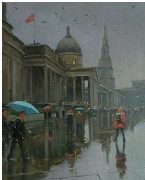
Chris Slater Rain Effect, London (20" × 16") Oils £895.00