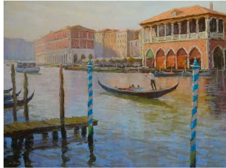
David Allen The Grand Canal at Rialto (15" x 20") Pastel £950.00