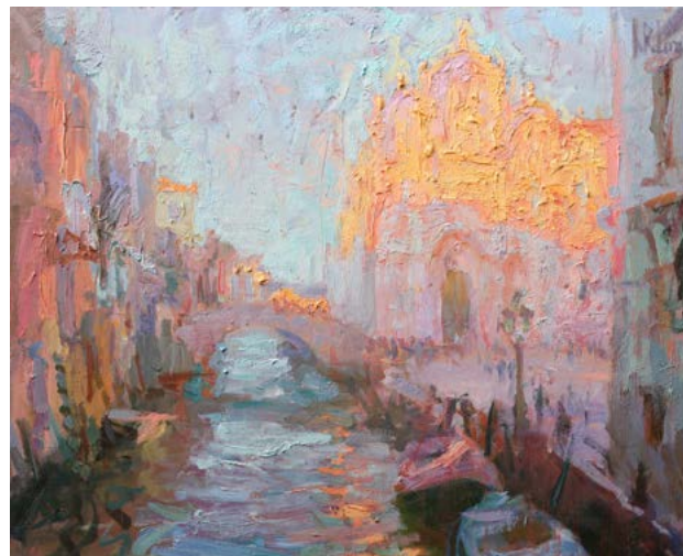
Norman Long Last Light San Giovanni E Paolo (20" x 24") Oils £1,395.00