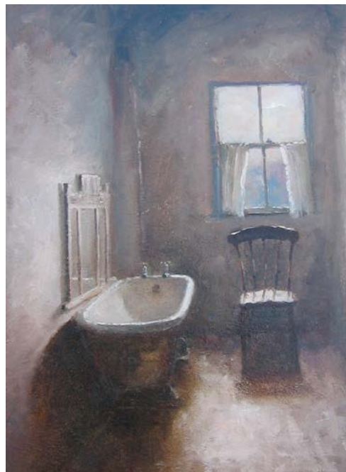
Ian Layton The Bathroom (13.5" x 9.5") Oils £695.00