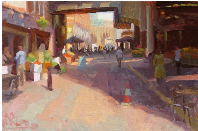
Norman Long Borough Market (12" x 18") Oils £795.00