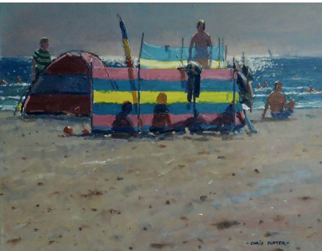
Chris Slater Contre Jour Cornwall 20" x 24" Oils £1200.00