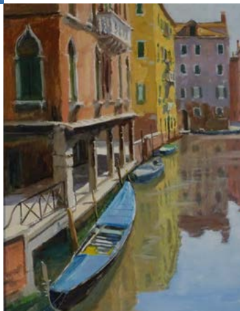
David Allen > Rio San Sofia, Venice (16" x 12") Oils €750.00