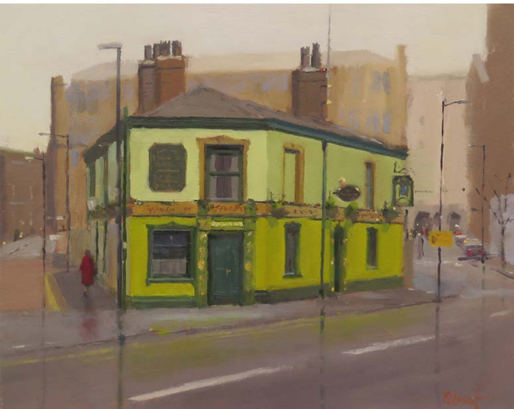
Michael Ashcroft Lady In Red, Peveril of the Peak, Manchester (10" x 12") Oils £950.00