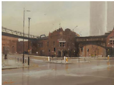
Michael Ashcroft Crossroads, Deansgate Station, Manchester (9" x 12") Oils £950.00