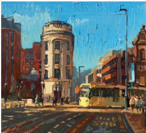
< Steven Smith The Liverpool and London and Global Insurance Building from Princess Street (10" x 12) Oils £785.00