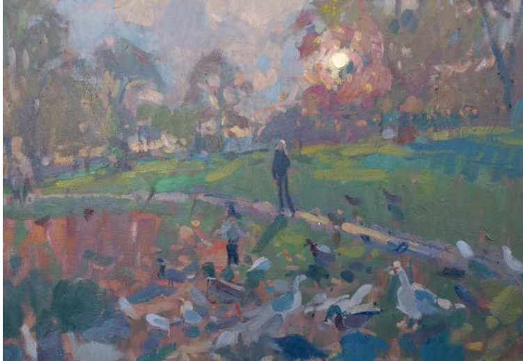
Andrew Farmer Sunset at the Duck Pond (18" x 24") Oils £1200.00