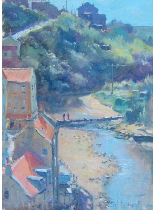
Ian Layton Staithes Spring Day (13.5" x 9") Oils £695.00