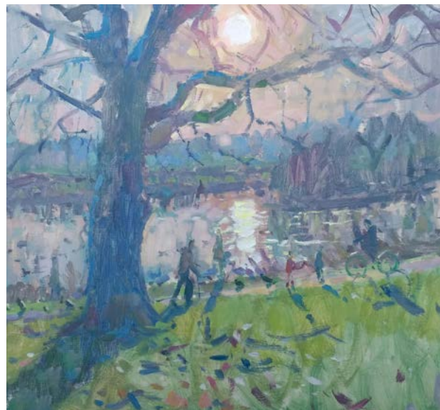
Andrew Farmer Feeding the Ducks, Morning Light (24" x 26") Oils £1400.00