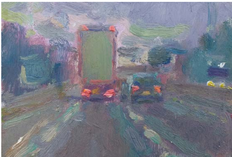
Andrew Farmer South Bound (5" x 7") Oils £350.00